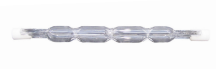
Linear C Class Halogen Lamp