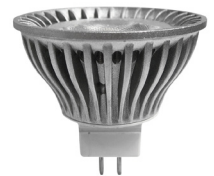
MR16 LED 12V DC GX5.3 3W