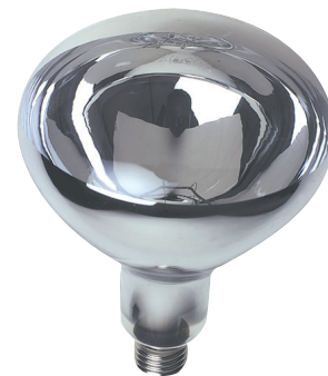
Heat Lamp 275W