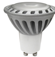
MR16 LED 230V GU10 4.5W

* Replacement lamps for HFL and Extract-a-Lite Ranges.