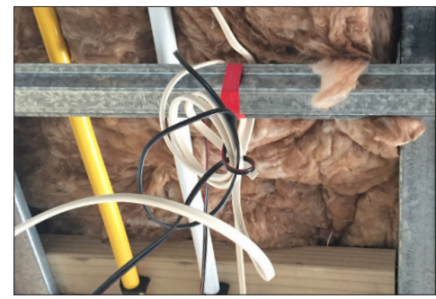
Typical cable installation